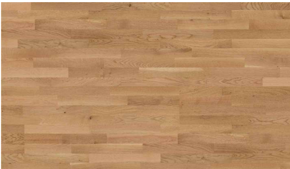
Eiche Prater - 4 Staff

Naturell: harmonious mixed grading. Light brushed, Matt lacquer natural.