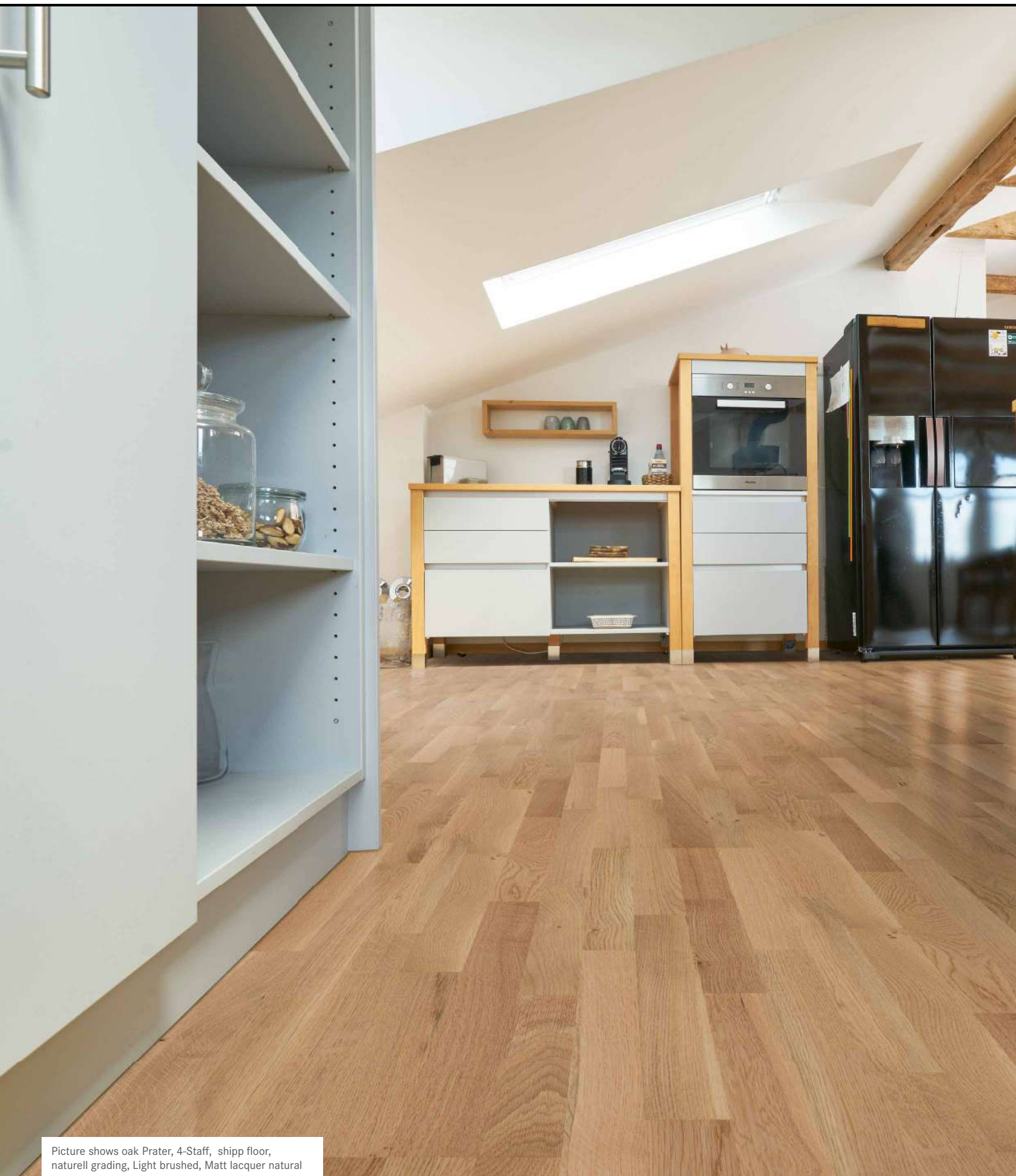
Picture shows oak Prater, 4-Staff, shipp floor, naturell grading, Light brushed, Matt lacquer natural