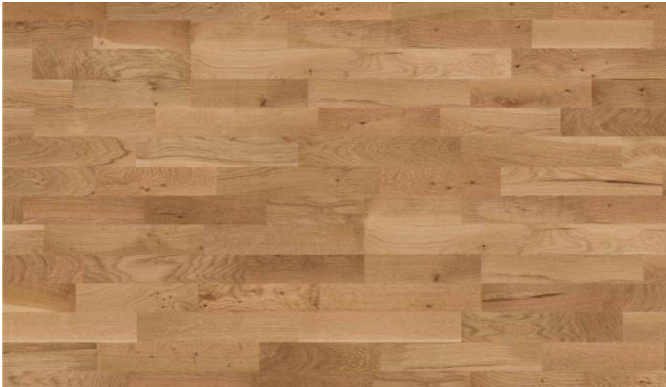
Eiche Cabo - 3 Staff

Six exclusive surfaces light brushed, treated ready for living.