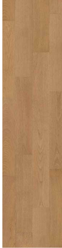
Oak Zuma Country house staff

Naturell: Natural appearance with brown spatulated point knots and low sapwood content. Brushed, Matt lacquer natural.