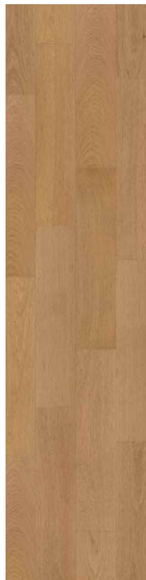
Oak Sky Country house staff

Naturell: Natural appearance with brown spatulated point knots and low sapwood content. Brushed, oxi geölt.