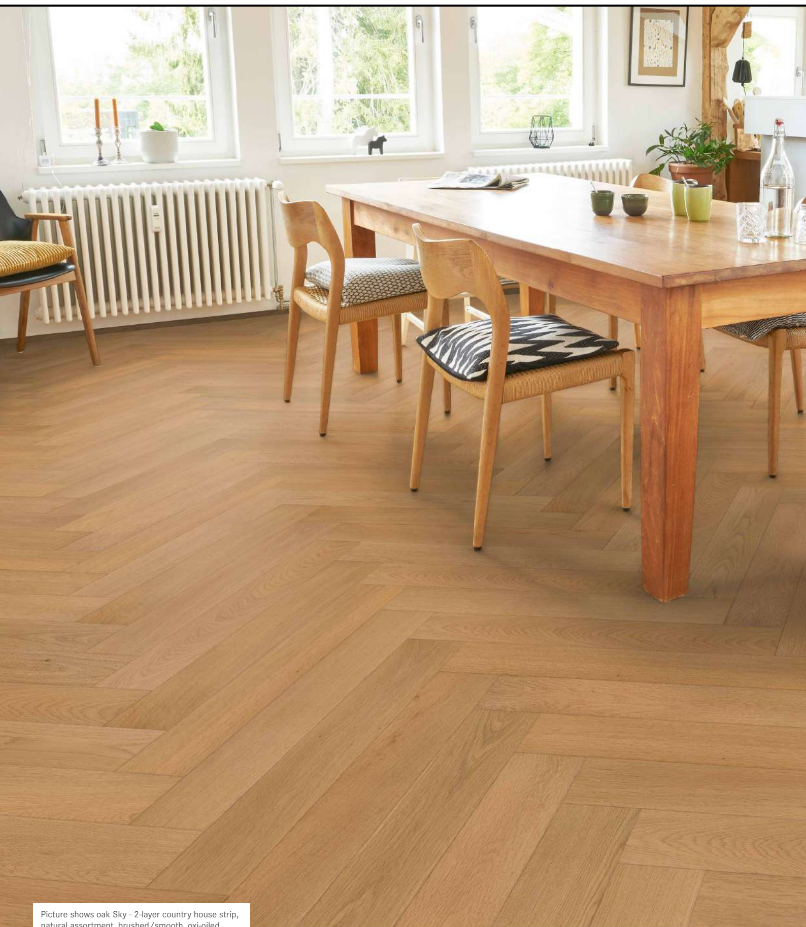
Picture shows oak Sky - 2-layer country house strip, natural assortment, brushed/smooth, oxi-oiled