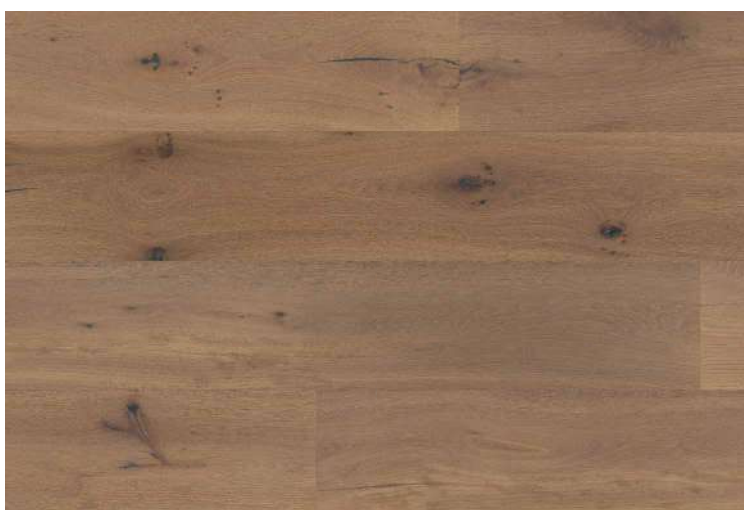
OAK SMART XL rustic, 4 sides beveled, brushed, smoked, white oiled