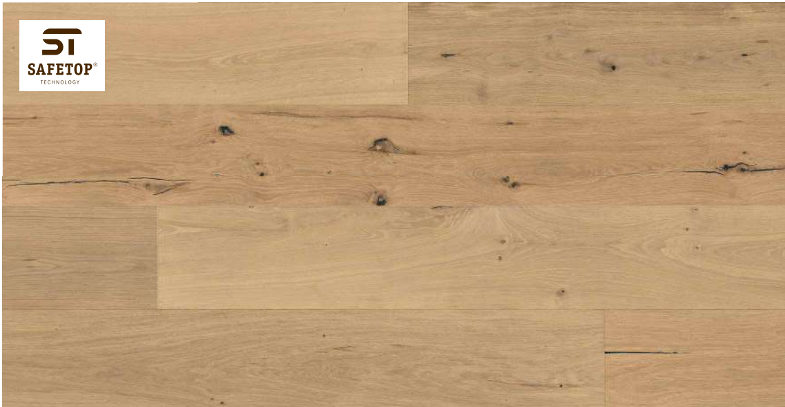
OAK PERGAMON XXL rustic, 4-sided bevelled, brushed, transparent oiled with SafeTO P ® technology