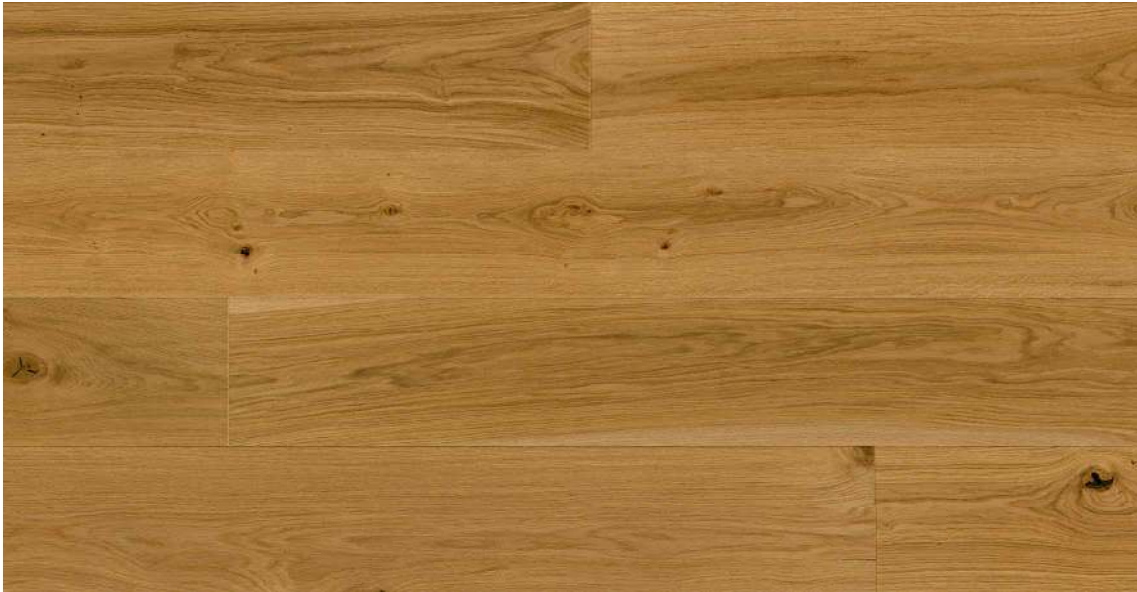
OAK LOUVRE XXL rustic, 4-sided bevelled, brushed, natural oiled