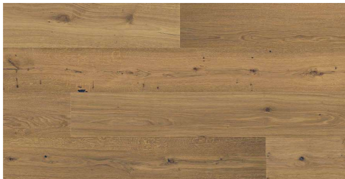
OAK MOMA XXL rustic, 4-sided bevelled, brushed, smoked, white oiled