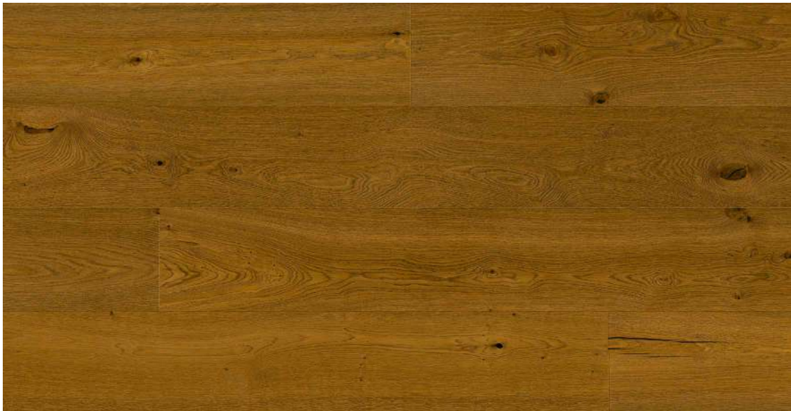
OAK TATE XXL rustic, 4-sided bevelled, brushed, smoked, natural oiled

Four exclusive oiled surfaces, ready for use.