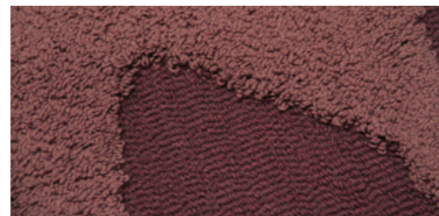
Monegros by Arik Levy