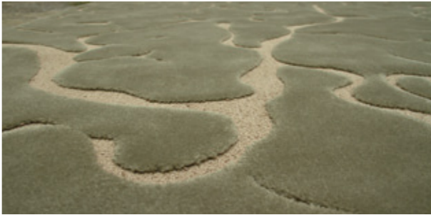
Andalucia by Arik Levy